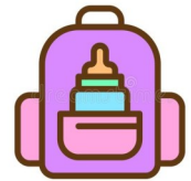
GO BAG PROJECT

Thank you to everyone who generously donated to assist children in foster care.