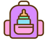
GO BAG PROJECT