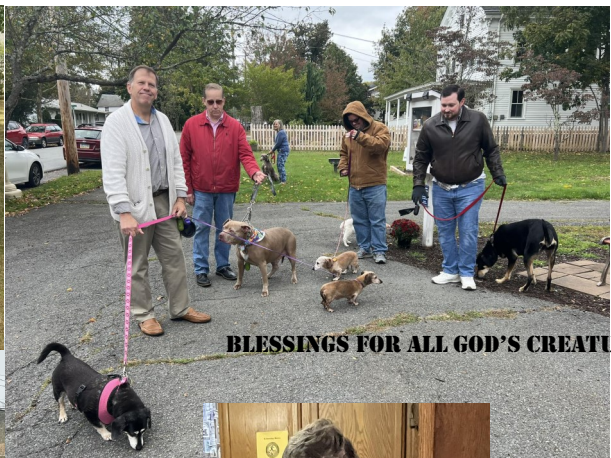
BLESSINGS FOR ALL GOD'S CREATURES