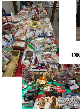
CRAFT & BAKE SALES

Give THANKS WITH A GRATEFUL HEART 1 Thessalonians. 5:18