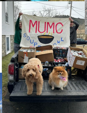
OUR SPIRIT OF GIVING AND VOLUNTEERING