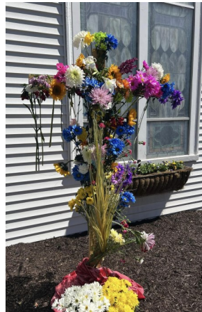
OUR BEAUTIFUL TRADITIONS