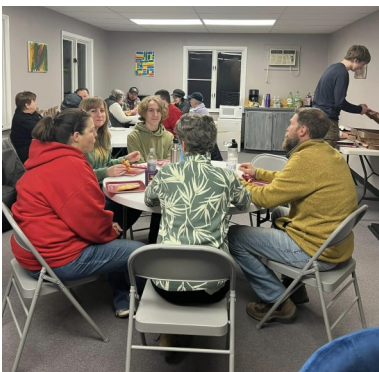
GAME NIGHT AND ALL THE TIMES WE GATHER TOGETHER