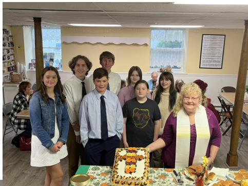
CELEBRATING CONFIRMATIONS AND NEW MEMBERS