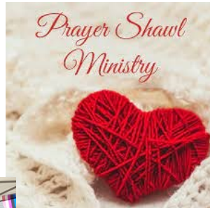
COMFORT & JOY