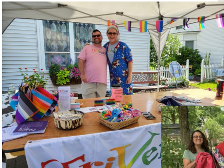
CONNECTIONS WE'VE MADE